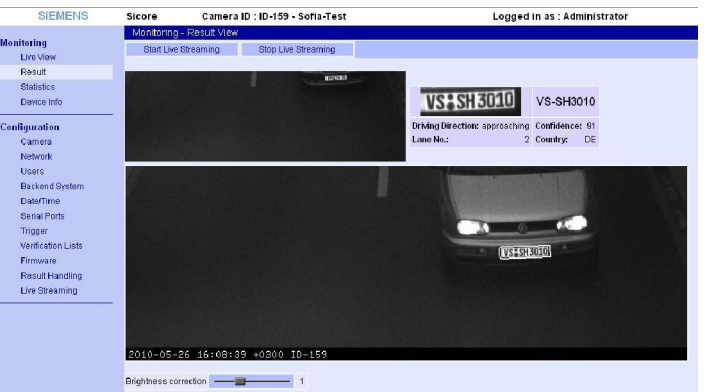
Fig 5. Result view from ANPR System in Web UI

The developed ANPR system is ordered by Siemens and is intended to work on Windows and Open Embedded OS. All threads' and processes' communications are based on the binary or text messages exchanged over TCP/IP sockets.